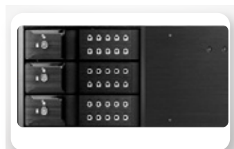
3x Hotswappable 3.5" Drive Bay